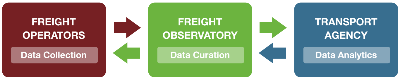
Figure 1. FreightSync Data Exchange Flow Chart

The first set of stakeholders are the freight operators (and telematics service providers) that will be tasked with collecting data on freight vehicles and receiving data from the traffic management system. The second is the trusted ‘Freight Observatory’ that will be tasked with curating data from multiple sources and making it available under agreed conditions to the transport agency. The third is the transport agency that will undertake data analytics and modelling to improve the overall traffic flow and provide direct guidance to freight operators.